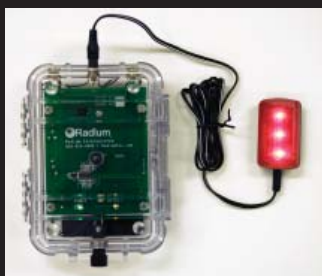
Red Strobe Lights