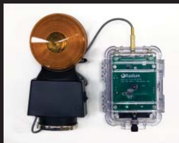
Amber Strobe Light