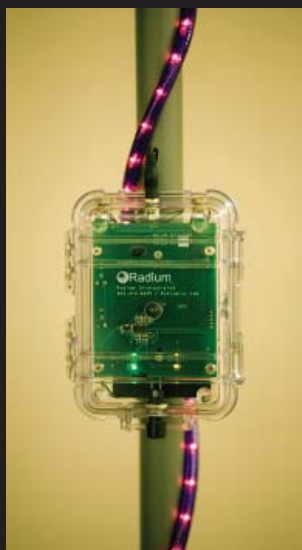
Magenta Lighted Rope