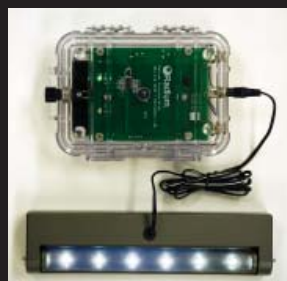
LED Light Bars